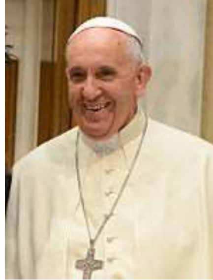
Vatican City State