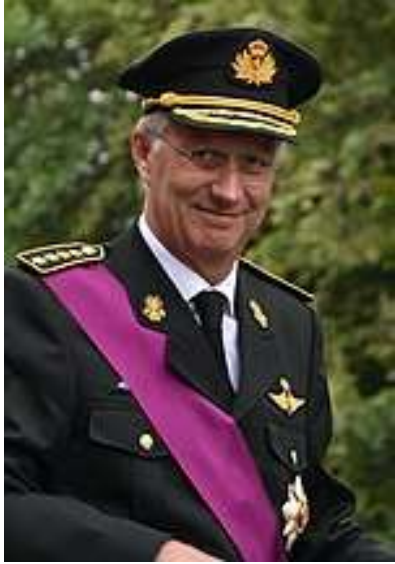
Kingdom of Belgium