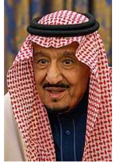
Kingdom of Saudi Arabia