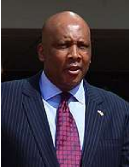
Kingdom of Lesotho