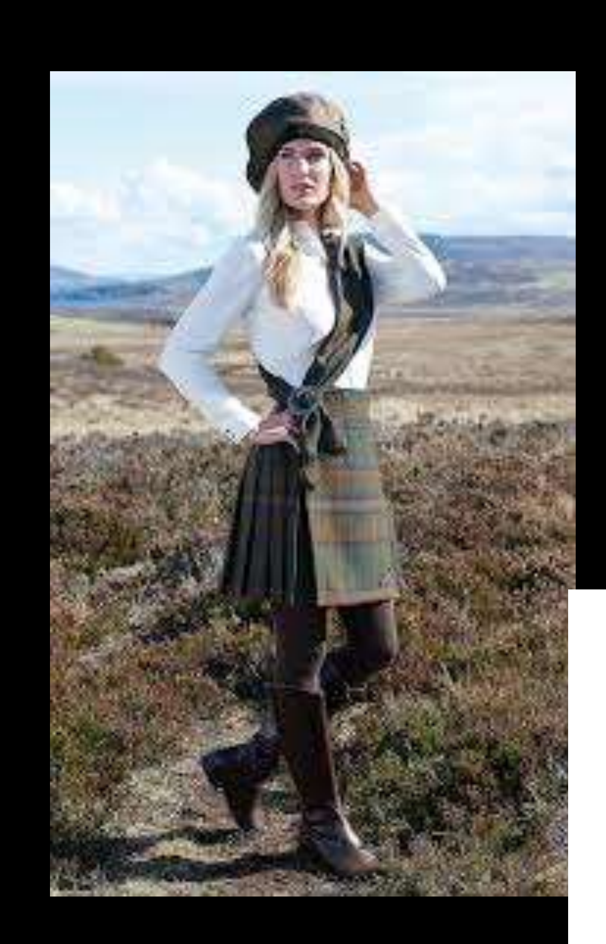
HOSTESS KILTS, MINI-KILTS, SKIRTS & DRESSES