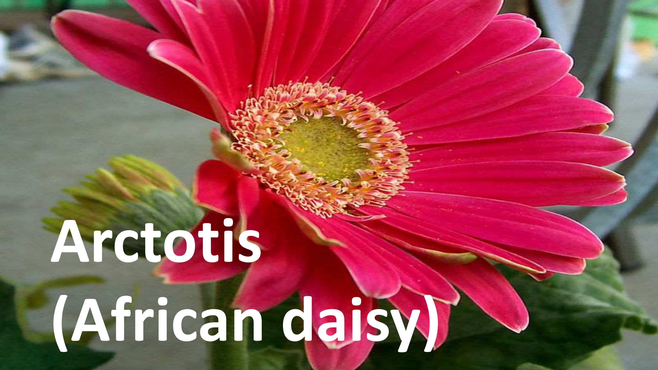
Arctotis (African daisy)